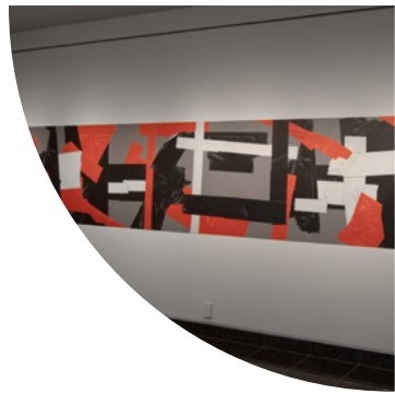
Sticky Study by Sébastien Pesot