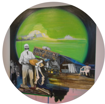
Qu'est-ce qui se trame? by Jérémie St-Pierre